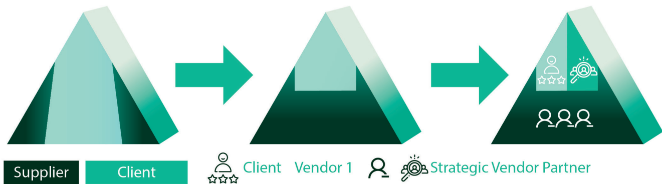
Figure 1. Evolution of Sourcing Staffing Models

The diagram above depicts the sourcing agility that is required as vendors become strategic partners in supporting client organisations to plan and identify critical elements in their AI and automation journey.